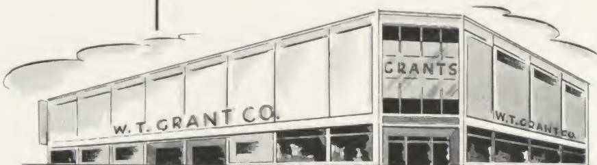
St. Paul, Minnesota

Bankers Trust Company, New York, N. Y., Registrar